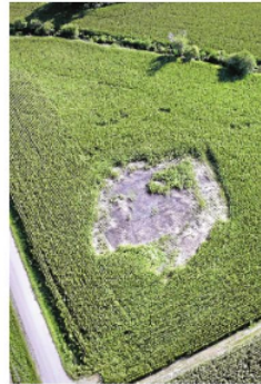
SILVER LAB PRODUCTIONS FOR LINCOLN JOURNAL STAR

When the Nebraska Department of Agriculture first reached out to the USDA, which regulates what language must appear on seed bag label, it was told enforcing what the label said was the responsibility of the EPA, whose authority is limited when it comes to products treated with pesticides or fungicides.