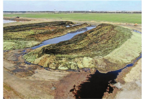
NEBRASKA DEPARTMENT OF ENVIRONMENT AND ENERGY

Nothing grows on a site north of Mead, shown in a photo taken Aug. 25, where AltEn's distiller's grains, or wet cake, was stockpiled.