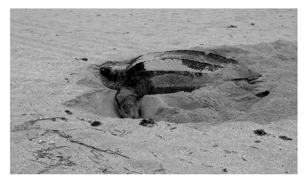
Dark Skies initiatives help a sea turtle at the GTM estuarine. Dark skies will be the topic at our group's meeting in September. See the article on page 2.