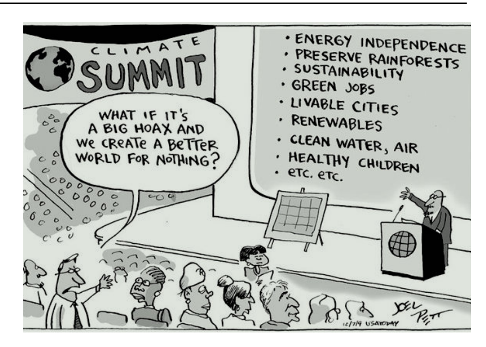
Just for laughs: Q and A time at a green meeting.