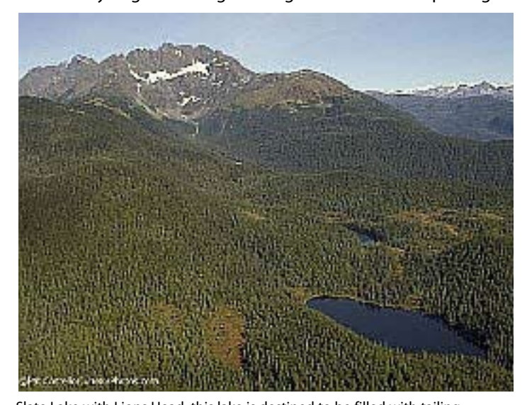
Slate Lake with Lions Head; this lake is destined to be filled with tailing

Kensington is a hard rock mining project proposed by Coeur d'Alene Mines Corporation of Idaho. It is located a few miles north of the City of Juneau road system (50 miles north of downtown Juneau) in the Tongass National Forest. Fifteen years and several proposed operating plans after the initial proposal, Coeur's current operating plan will pipe 4.5 million tons of mine waste into Lower Slate Lake in the Tongass National Forest. (See alaska report, March '04, Sept., Nov. '02, Aug. '99, March '94). The Club's Juneau Group and others have opposed this operating plan since its inception, because of the dangers of toxic waters stored in the lake and the irrevocable impacts on nearby Berners Bay and its watershed. Under this plan, and since the Corps granted the permit this past summer, Coeur has already begun moving docking facilities for transporting