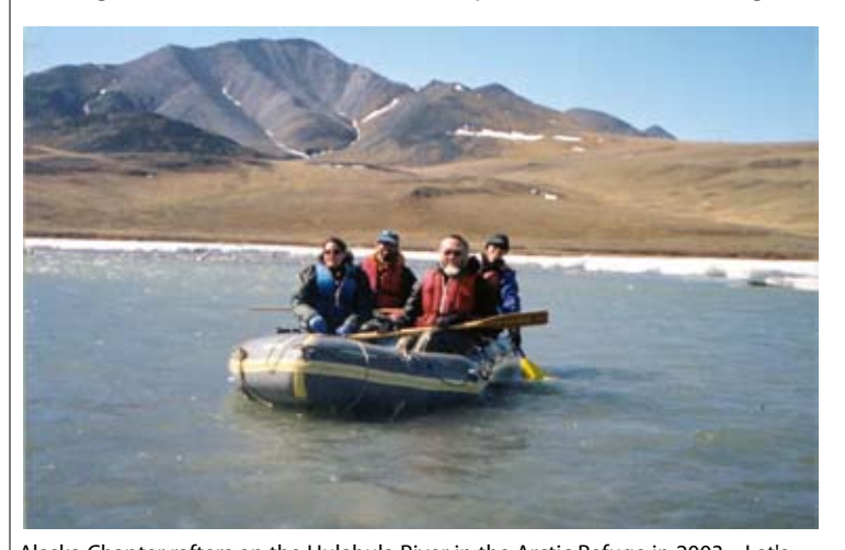
Alaska Chapter rafters on the Hulahula River in the Arctic Refuge in 2003. Let's keep this kind of wild experience available for future generations!

On Oct. 18, the Senate Energy and Natural Resources Committee marked up and passed legislation that would authorize drilling in the 1.5 million acre coastal plain of the Arctic Refuge.