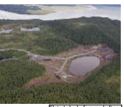
Slate Lake before and after

The US District Court for Alaska on September 25 issued a strongly worded decision that could save the internationally significant wildlife habitat around Teshekpuk Lake in the Northeast Planning Area of the National Petroleum Reserve, Alaska (NPRA). The court found that the Interior Department shortchanged environmental protection for Teshekpuk Lake through an environmental analysis that violated federal environmental laws. The ruling strikes down the Interior Department's leasing plan for the area and prohibits the BLM from proceeding with a planned sale of oil and gas leases on more than 400,000 acres around the lake. The lease sale was to have taken place September 27.