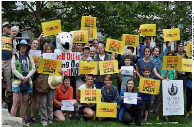
Sierra Club's Massachusetts Chapter cheers Ed Markey's championship for the Arctic

The sensitive Arctic Coastal Plain provides crucial habitat for muskoxen, wolves and migratory birds, calving grounds for caribou, and denning areas for polar bears. The Coastal Plain is threatened because the oil and gas industry has targeted it for industrial development. The new Senate bill and H.R. 239 offer a sensible alternative to several drilling bills in this Congress—that disregard ecological, cultural and spiritual values.