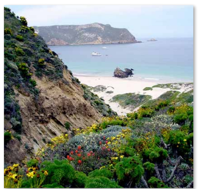
Cuyler Harbor with flowers busting out all over San Miguel Island, is one of the stops for Sierra Club California's Channel Islands trips this year.