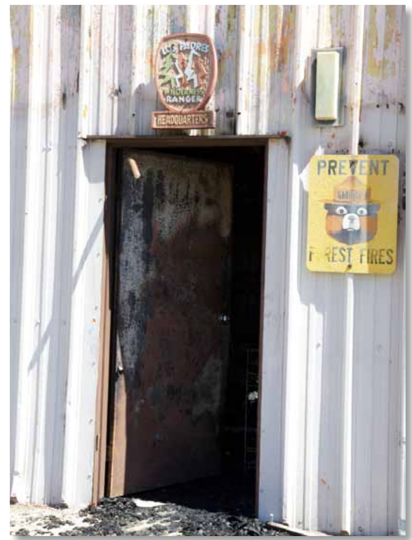
Everything burned – except the Smokey Bear sign – at the headquarters for the Los Padres Volunteer Wilderness Rangers during the 2013 White Fire in late May, along the Santa Ynez River. VRW lost a lot of tools, gear and supplies that now need to be replaced.