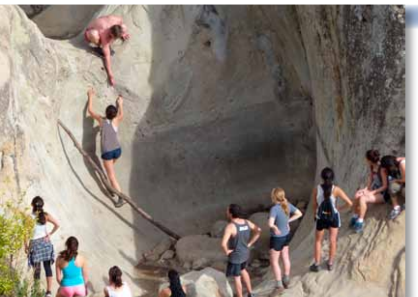
Above the Seven Falls area in Mission Canyon is a primitive, rocky trail to Cathedral Peak involving a lot of rock hopping and a very steep elevation gain of about 2,000 feet. Here's a portion of it sometimes called "Dragon's Back".

VENTURA HILLS: Join Wilderness Basics Course (WBC) staff, students, and friends to get a good mid-week hill climb workout and walk through scenic Ventura. About 2 hours, 3.5 miles, total gain about 300 feet. Bring water and flashlight. Meet at 5:30pm across from the Mission San Buenaventura in downtown Ventura. For more info, call TERESA at 524-7170 (VEN)