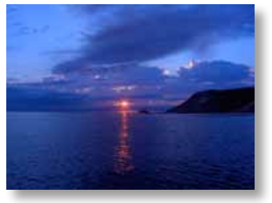
Channel Islands sunset, pg 12.