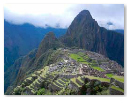
Machu Picchu is one of the foreign destinations offered by the Sierra Club.

Go beyond California from Alaska to Wyoming: "Mule Packer Paradise: Ranch Maintenance in Shawnee, Col," "Wild Trout Recovery New Mexico," "Wild Crags of the North Cascades," or