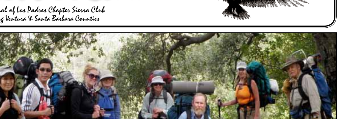
Wilderness Basics Course students and leaders from a prior class pose during a backpack trip to Forbush Flat.

Journal of Los Padres Chapter Sierra Club Serving Ventura & Santa Barbara Counties