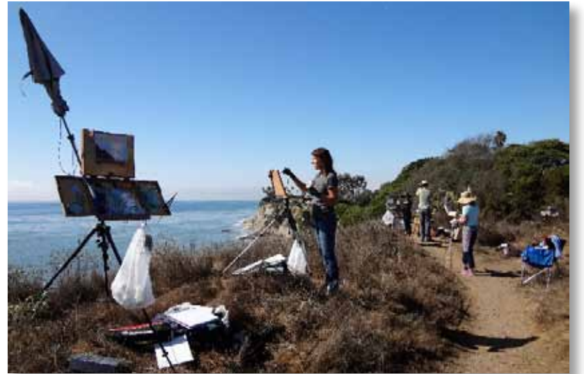
A typical "Paint-Out", this one along the More Mesa Bluffs.

Watch for details in the Condor Call or through the art group at:www.s-c-a-p-e.org