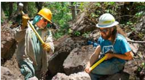
Sierra Club trips also include "service," meaning work projects that still allow a lot of time for exploring. This shows trail workers in New Mexico.