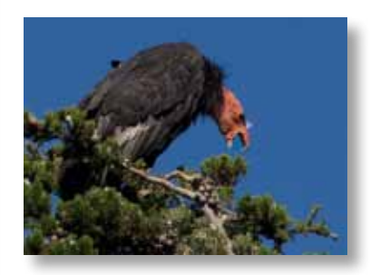
Condor caws "we want more wilderness." Pg 5.

comes out 1st of April DEADLINES: Editorial: Mar. 20 Advertising: Mar. 24 Questions? Call 452-2885