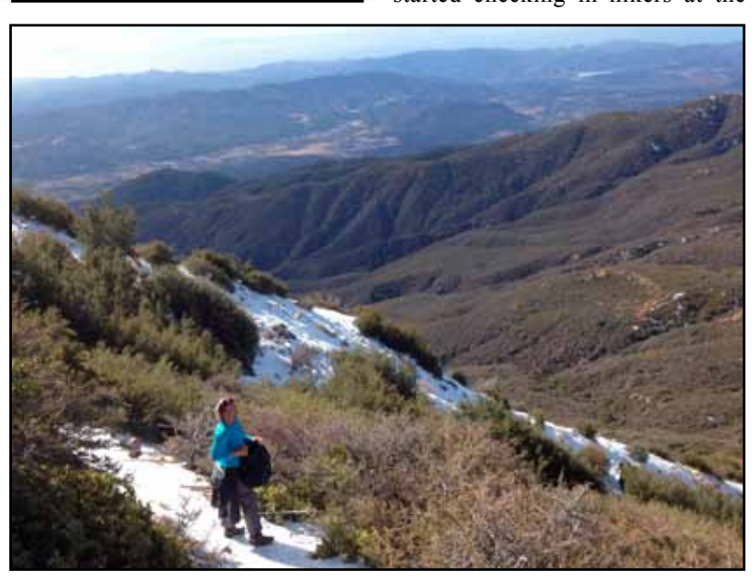
One of the views from the Topa Topa bluffs.

To report anonymously, call Crime Stoppers at 800-222-TIPS (8477).