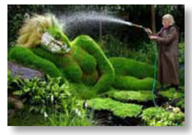
Mother Earth's lovely lands, pg. 11. (Internet photo)