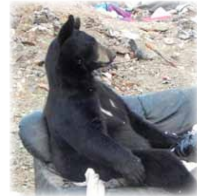
Is nature photography too beautiful? Do bears sit in the woods?

The first draft regulations proposed some use of non-lead ammunition in 2015 and 2016 with no further implementation until 2019. While the best option for our environment and wildlife