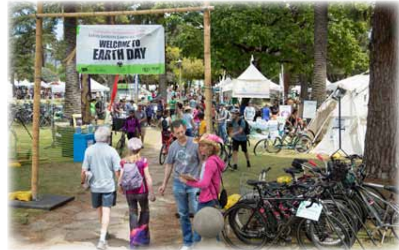
Welcome to Earth Day indeed! Santa Barbara’s celebration was, as usual, huge and full of excellent information. The Community Environmental Council has scores of photos for your enjoyment, see them at www.cecsb.org

“A few people asked what our position was concerning water issues or why we were supporting