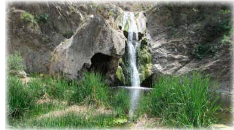
There's water at Paradise Falls in Wildwood Park despite the drought, according to Doc Caballero who creates local trail maps with the slogan "Lost? Don't Be." But not in many other places. Moral: Drought or no drought, always carry more water than you think you need.

Not to worry, I still had that other back-up bottle. But when I let go of the Camelback to unscrew the second bottle,