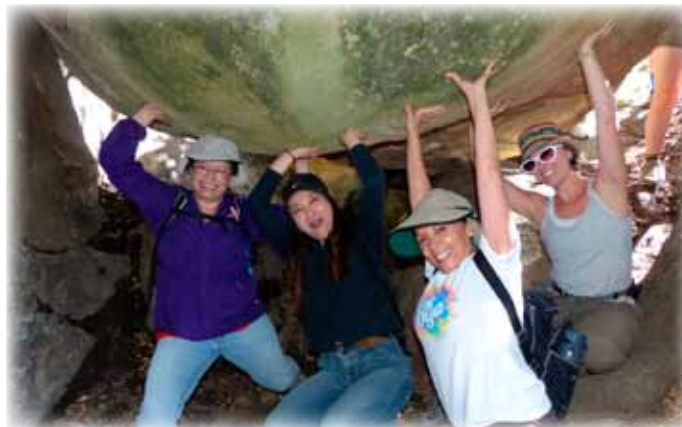
Atlas Shrugged and these Sierra Club hikers pitched in... yet another benefit of our outings and actions.

All Together Now Join the club www.Sierraclub.org