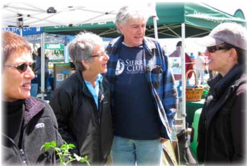
Our State Sen. Hannah Beth Jackson (second from left) came by the Ventura Sierra Club booth and was greeted like an old friend, which she is.