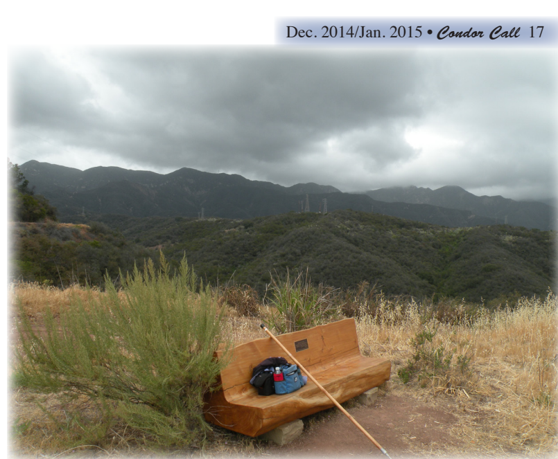
The restful Ducas Family Bench along the Franklin Trail above Carpinteria promises sweeping vistas from Ventura to Santa Barbara.