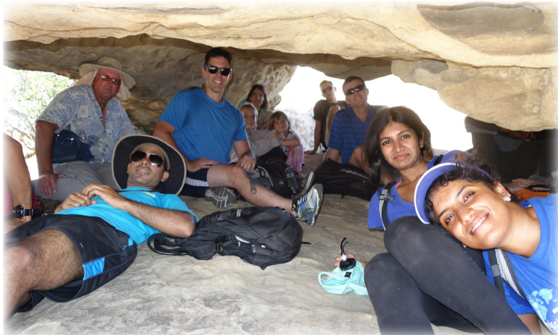
Remember how hot it was in October? Well, that didn't stop a full house of hikers going to the amazing Playground area, but they did pause for shade.