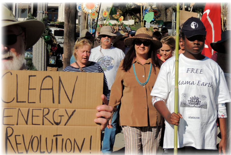
After the Ventura Climate Rally speeches at city hall, scores of marchers walked into downtown and to the pier, picking up supporters of climate change along the way.

Read the decision at: http://tinyurl.com/NewhallCourtCase