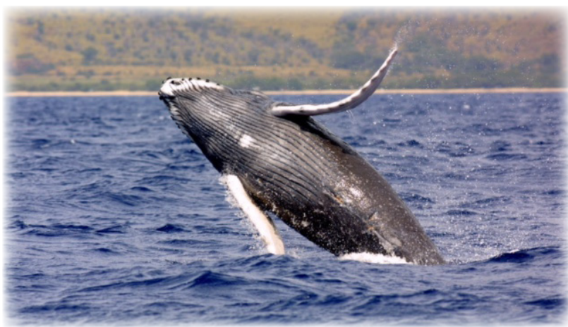
Humpback whales are just one of the reasons why proponents are supporting a new Marine Sanctuary off the San Luis Obispo and Santa Barbara coasts.

The Sierra Club was founded by the vision of a man living in the San Francisco Bay area who cared a great deal about the majestic Sierra Nevada mountain range. John Muir was so alarmed that he formed a small organization called the Sierra Club in 1892. It was to protect a