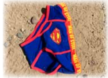
What was Superman doing at the Santa Clara River that caused him to lose his underpants?

Editor's note: More than 510,000 pounds of trash was plucked from the state's beaches, ocean, rivers, parks, lakes and other areas as part of Saturday's (Sept. 16) 33rd annual California Coastal Cleanup Day, according to early tallies. An additional 31,912 pounds of recyclables was collected by nearly 1,000 volunteer sites in 55 counties, the largest number of sites in the cleanup's history. Here's what happened locally: