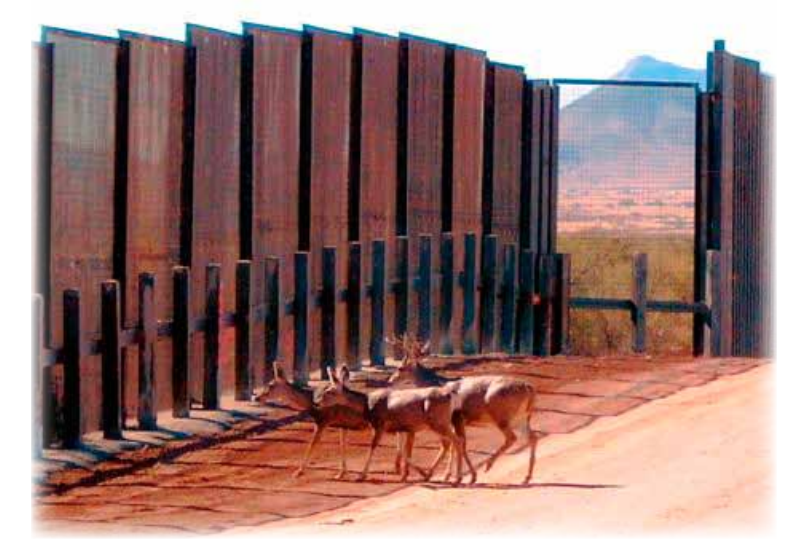
Oh dear! Border wall cramps wildlife, butt .... the heads of national conservation groups, including Sierra Club, filed suit Sept. 14 against Homeland Security challenging border wall construction that threaten wildlife and public lands in San Diego and Imperial Valley, California,