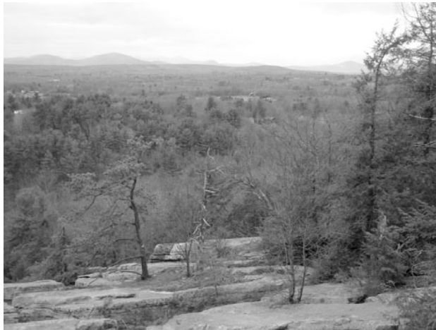
The expansive view of the distance mountains from Table Rocks

The Mohonk Preserve maintains a large area of lands on the Shawangunk Ridge west of New Paltz. If you have never visited the preserve it is well worth it. There are easy, scenic trails, as well as longer, more challenging ones. We started out from the Spring Farm trailhead on the West side of the ridge on our relaxed hike. Although a bit cool the trails were easy to navigate and the view from Table Rocks was spectacular.