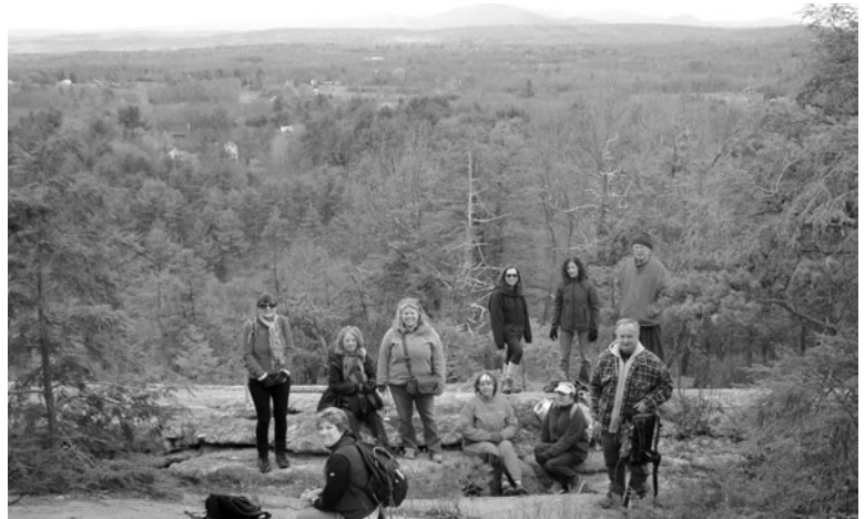
Our group at Table Rocks. The wind kept us bundled up as we prepared for lunch.