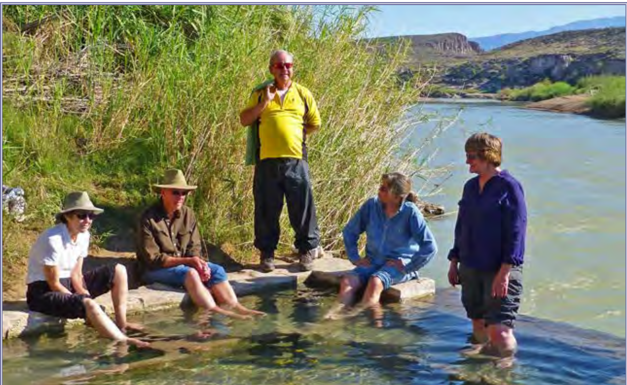
At Hot Springs historic site on the Rio Grande