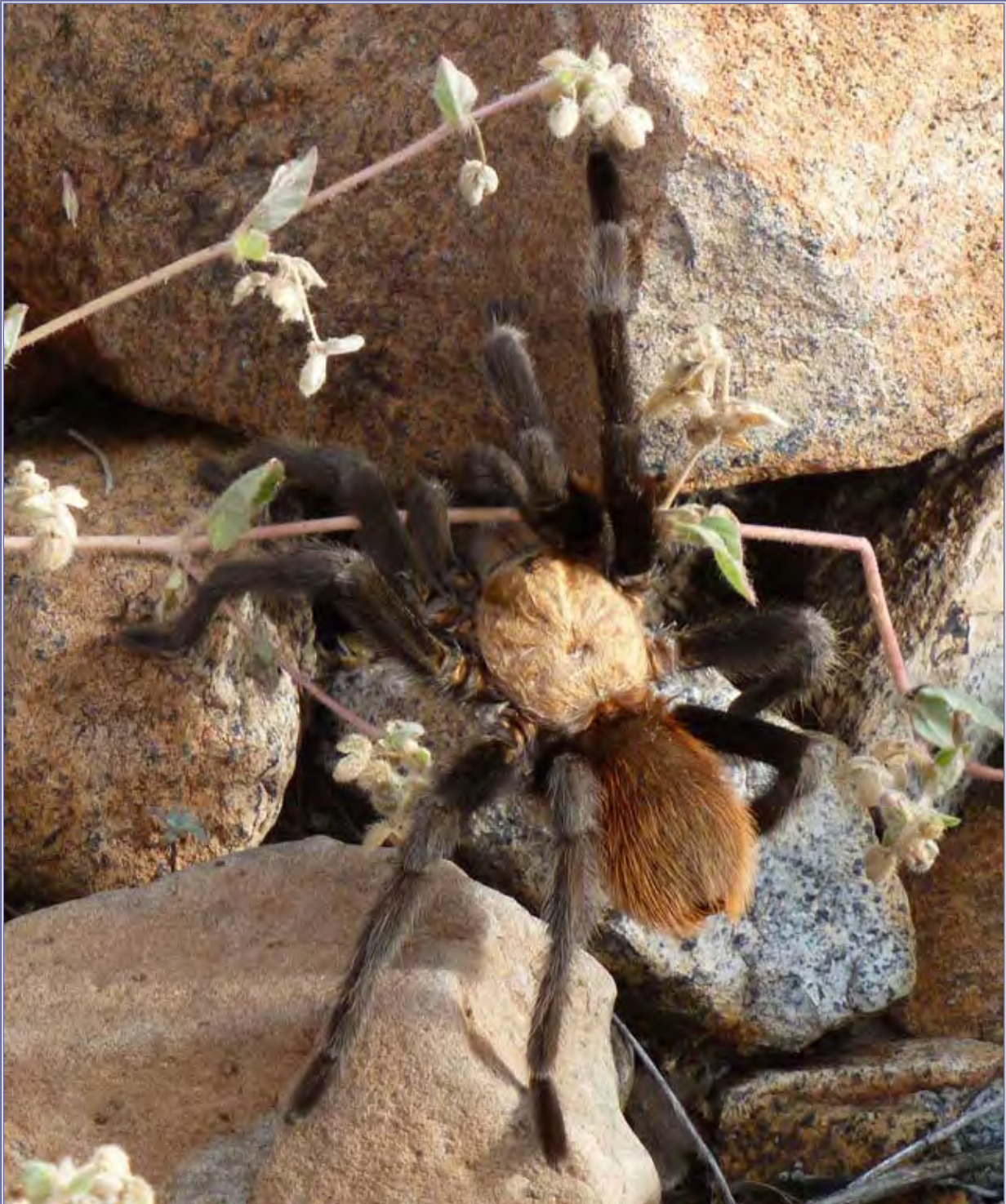
There was a healthy tarantula population