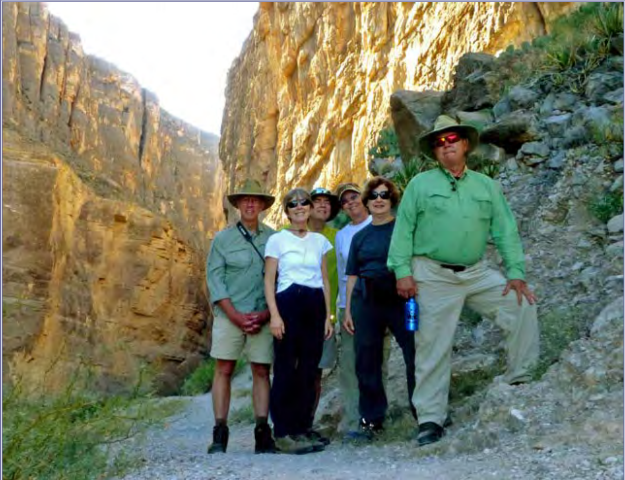
At Santa Elena Canyon