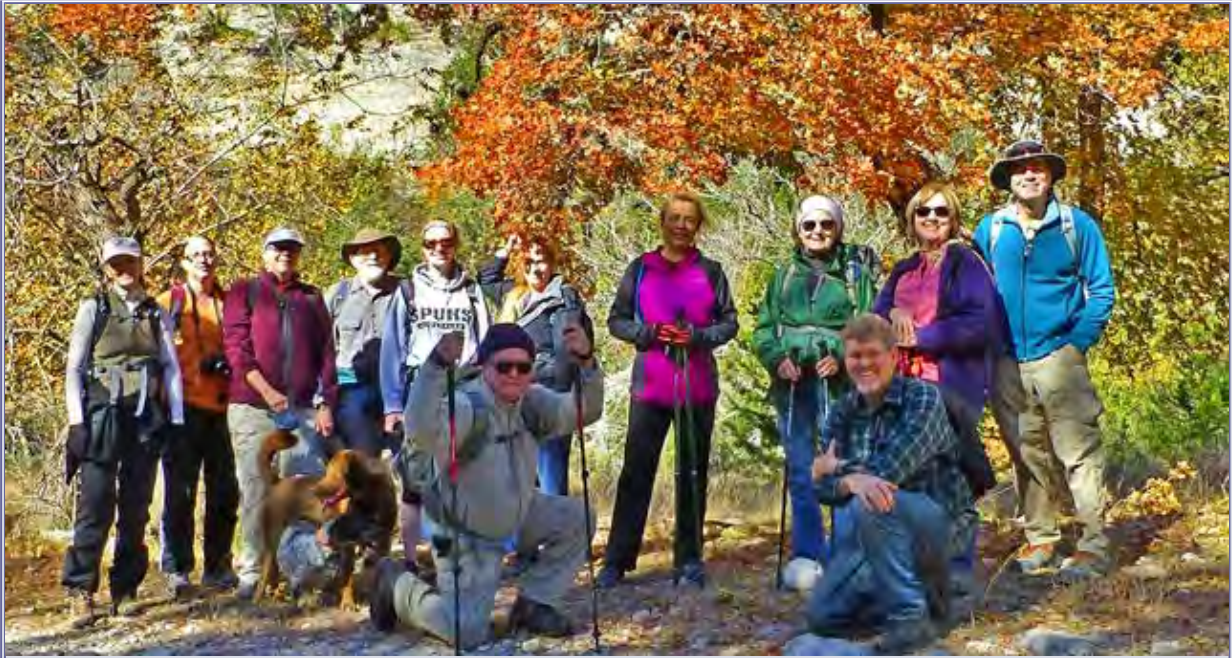
Sierra Club hikers on the Maple Trail at Lost Maples SNA

See our web page for more information on Alamo Group outings. There please note the link to meetup.com/Alamo-Sierra-Club-Outings where we manage our sign-ups for outings. For more information on this park, see the Texas Parks and Wildlife web page for Lost Maples State Natural Area .