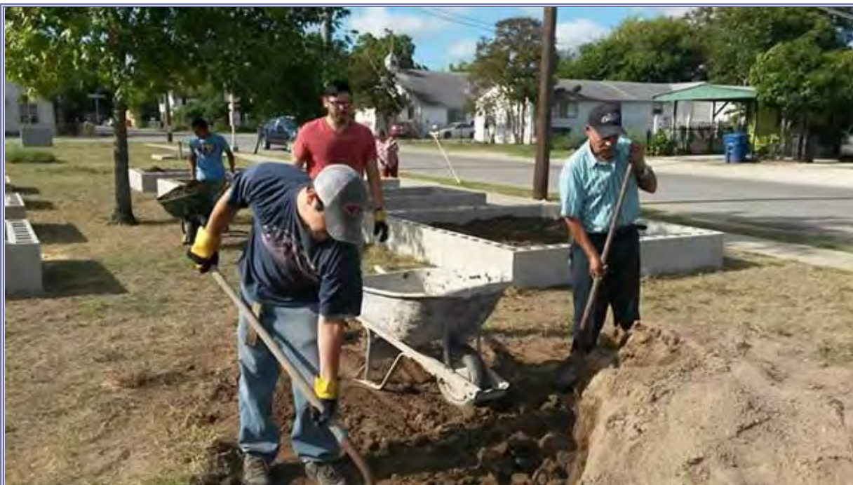
The South San Main St Project and residents carrying soil for the garden beds on a Sunday, showing their dedication to the project

The Alamo Sierra Club is recognized by the South San Antonio Independent School District for its $500 donation to the South San Main Street Project (SSMSt) and Dwight Middle School Learning and Community Garden project. The SSMSt Project partnered-up with Dwight Middle School to build a Learning Garden for the students and Community Garden for the residents of the Quintana Community. The idea originated from the competition by the Texas Public Radio 2012 Lighter! Quicker! Cheaper! Neighborhood Revitalization Project, which the SSMSP was the runner-up.