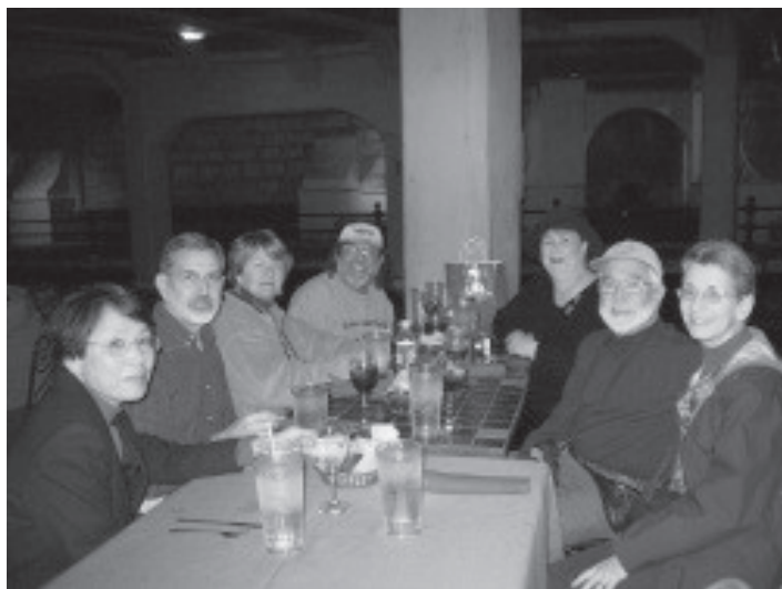
Social at Casa Rio on the Riverwalk, December 2006