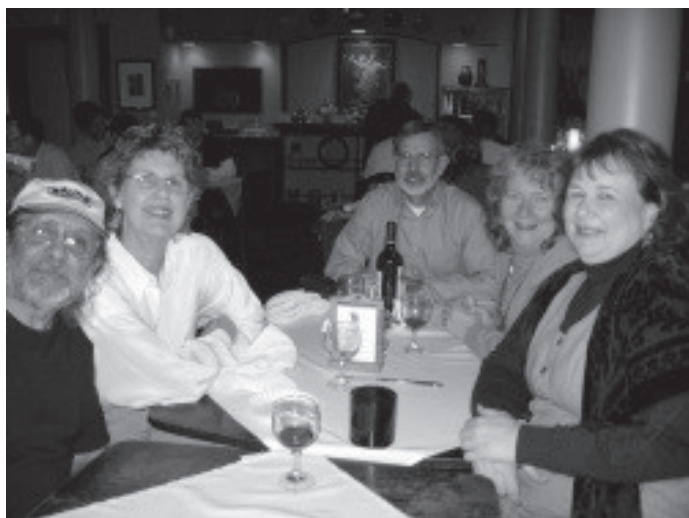
Social at Candlelight Coffee House, November 2006