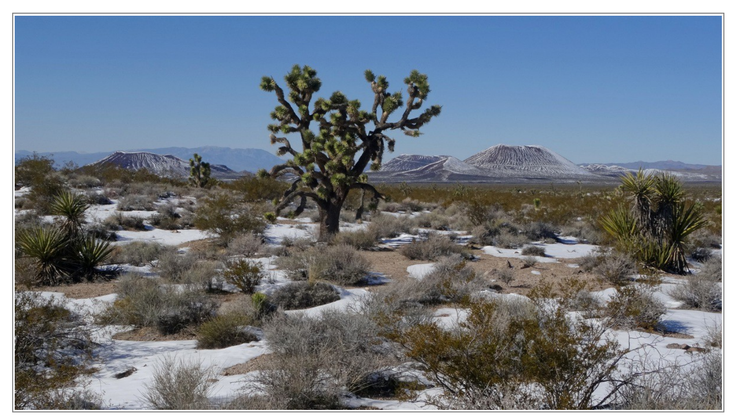
Mojave National Preserve: cinder cones and joshua trees in the NW area of the preserve a few days after a blizzard. The joshua tree center is about 20' tall. Old mining roads are visible on the cones. Off Kelbaker Rd, about 2900'.

there may be none alive in Joshua Tree National Park due to global warming. A <u>petition</u> was submitted to the Fish and Wildlife Service to list the joshua tree as threatened.