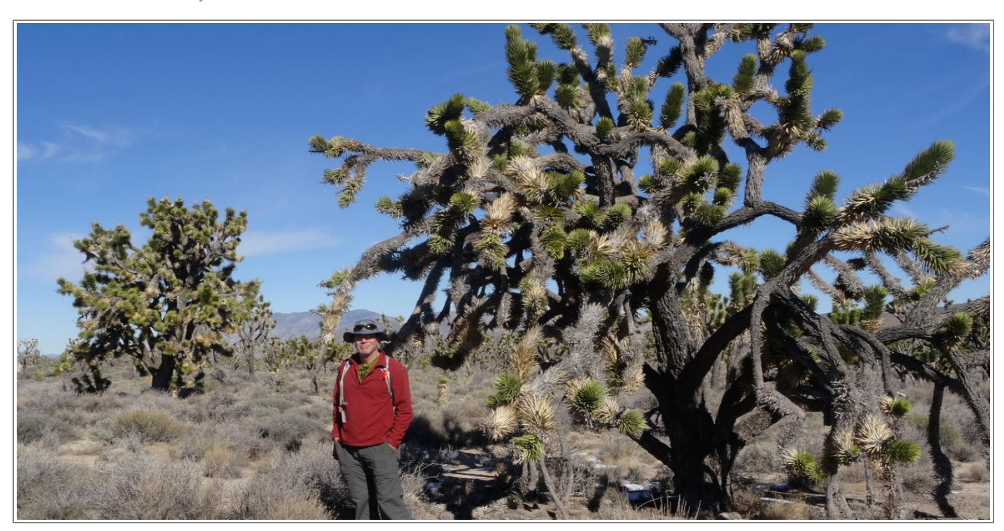
Mojave National Preserve: the "forest" of joshua trees on Cima Dome, from the Teutonia Peak Trail. At 5200' this is a hospitable environment for the joshua tree.

Here's an LA Times article about this listing petition, Sept 30 2015.