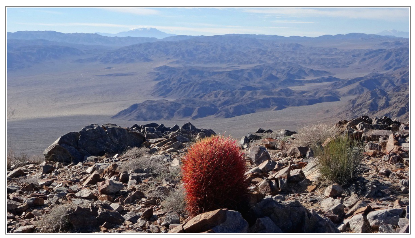
Joshua Tree National Park: looking WNW from Pinto Peak, 4000'. The hills center and right are in effect fingers of the Mojave Desert to the north interlaced with the lower elevation Sonoran Desert to the south. The park road climbing north from the Sonoran into the Mojave is visible left. San Gorgonio Mountain, in the new Sand to Snow monument, is visible on the horizon 60 miles away. At 11,500' this is the highest peak in southern California.

With these new national monuments much of the Mojave Desert is protected; this is particularly important as the fragile environment is severely threatened by global climate change and development. The Mojave is the smallest of the deserts in the continental US; the others being the Chihuahuan, Sonoran and Great Basin. Here's an overview article on these deserts with map.