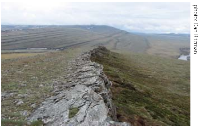
The Western Arctic's long sweeping ridges stretch off into forever space

A New Plan for the Reserve: On July 28, 2010 the BLM officially started a new planning process for the entire Western Arctic Reserve. The new Area-wide Plan, when finalized, will guide land management in the entire -- continued next page