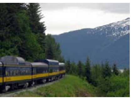
The Alaska Railroad

The Alaska Railroad was built between 1914 and 1923, before the car-highway era. Anchorage, Palmer and