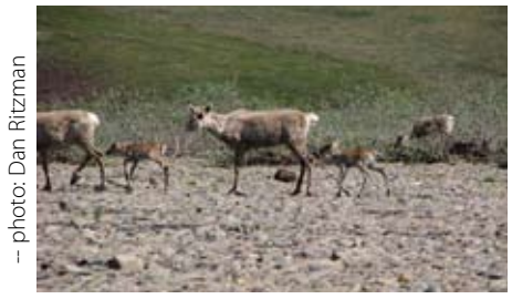
Caribou in the Western Arctic Reserve

The Opportunity for Balance : The new planning process provides a unique opportunity to ensure that future development in the Western Arctic Reserve is balanced with conservation of the biological and wilderness values