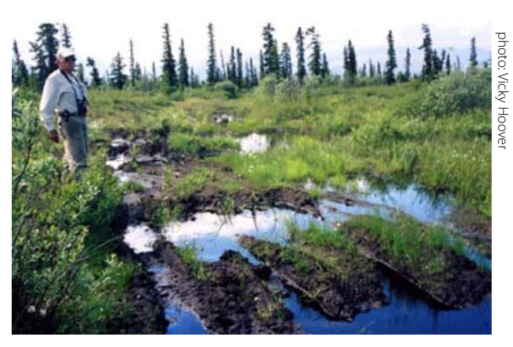
Off-road vehicles allowed on the Tanada Trail in the Nabesna District of Wrangell-St.Elias National Park have not been good for the fragile landscape.