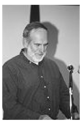
Cliff speaks up for the Tongass

Stopping a new pulp mill was not the end of Cliff's working to protect Admiralty Island and the Tongass National