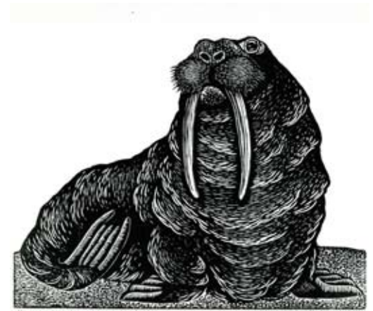
Bull Walrus © Dale DeArmond

An oil disaster is occurring in Norway's waters right now. On February 17, a tanker ran aground near Norway's only marine reserve, leaking some if its 204,800 gallons of