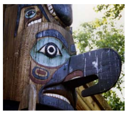
Ketchikan: Totem Bight State Park

Judge Sedwick wrote in his ruling that the 2003 decision by the U.S. Forest Service to exempt the Tongass from the national roadless rule was "arbitrary and capricious". As Sierra Club forest activist Mark Rorick, in Juneau, asserted, "It certainly was. The Tongass exemption was the result of a court settlement between the Bush