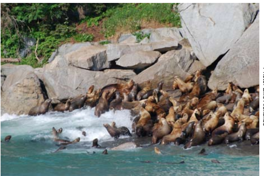
The proposed road would be built next to Gran Point, a Stellar sea lion haulout and critical habitat area

allows the governor to focus on more viable transportation projects, like Alaska ferries and maintaining roads in the population centers of Alaska. This positive step will benefit communities throughout our region."