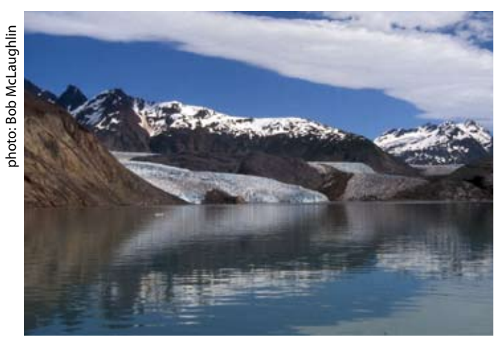
Glacier Bay National Park

The National Park Service itself opened the door to the two senators' attack on the park, after previously helping protect the park from seemingly endless attacks by the Alaska congressional delegation. When an earlier superintendent proposed a joint NPS-Huna Tlingit cultural