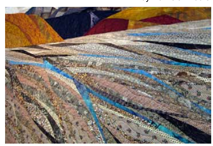
Detail of one of the striking works of art in Voices of the Wilderness, the 50th anniversary Wilderness art show travelling through Alaska. This is from Linda Beach's "Threading Through the Gravel Bars, East Fork of the Toklat".