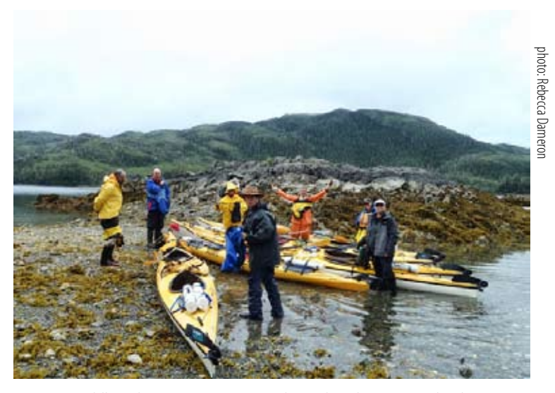
First paddling day out, gearing up to clean a beach on Ingot island

What's the connection between these three topics? These were the three interrelated conservation themes of the July 2013 Sierra Club national outing to Prince