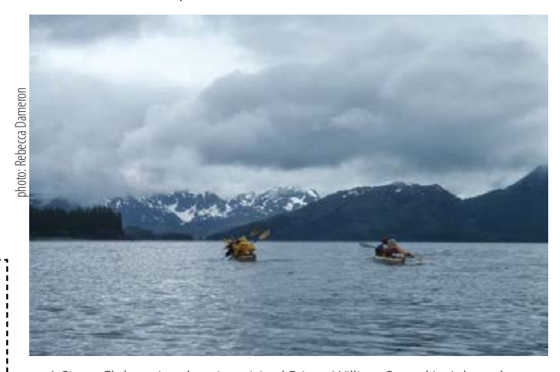
A Sierra Club national outing visited Prince William Sound in July and enjoyed the spectacular Wilderness Study Area. (see article pp 4-5)

This next round of public meetings follows a preliminary series of public meetings held by the Chugach Forest in February of 2013.