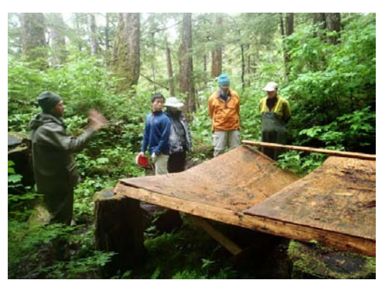
Trip members hard at work dismantling an abandoned old work camp on Knight Island -- to restore the area's wilderness character

coho salmon freshly caught by Barbara Lydon and grilled over a beach fire.