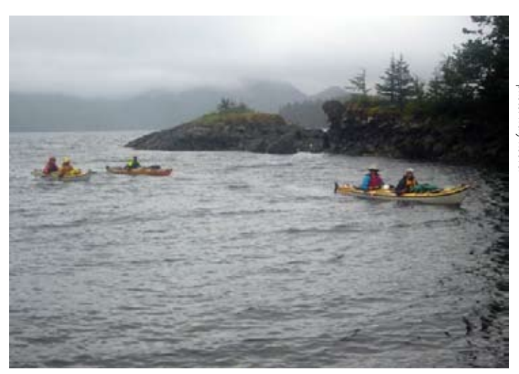
The flotilla returns to camp at Herring Bay on a typical misty day

Herring Bay was more of a rain forest campsite than a beach site. Here, the steady moist and misty weather (typical of coastal Alaska) dictated less paddling to distant beaches and more time spent nearby in dismantling an old abandoned research camp to restore the area's wilderness qualities. Each day saw good hearty meals as devised by leader Jan, sociable campfires to burn discarded wood pieces and to dry gear, some nearby paddling, and talks by trip conservation officer Vicky Hoover on opportunities presented by the 2014 50th anniversary of the Wilderness Act and by ranger Tim Lydon on the Forest Service's activities around the Chugach. A highlight one evening was feasting on -- go to next page