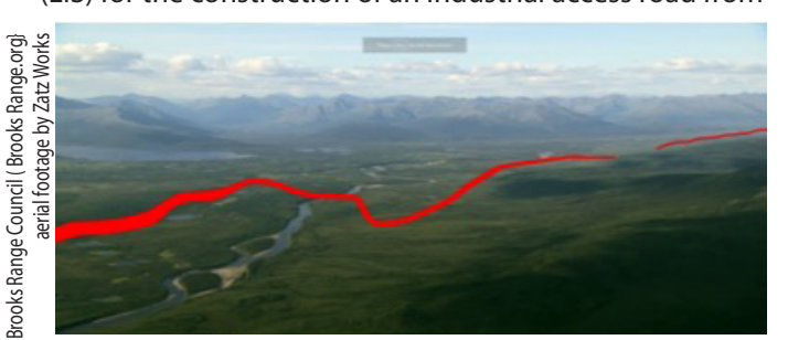
Ambler Road-artist's depiction

On March 26, 2020, the Bureau of Land Management (BLM) released the Final Environmental Impact Statement (EIS) for the construction of an industrial access road from