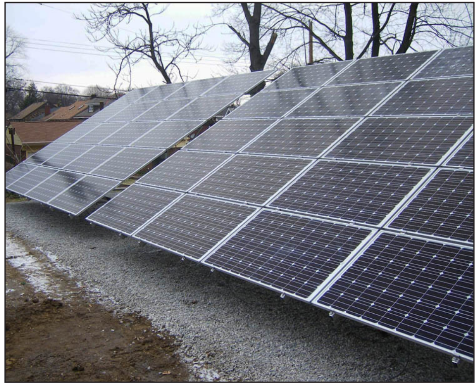
"US Solar" Continued on Page 9

100 Megawatts. This was important because banks considered these loans risky, since solar farms that big had never been built before. So federal loan guaran-