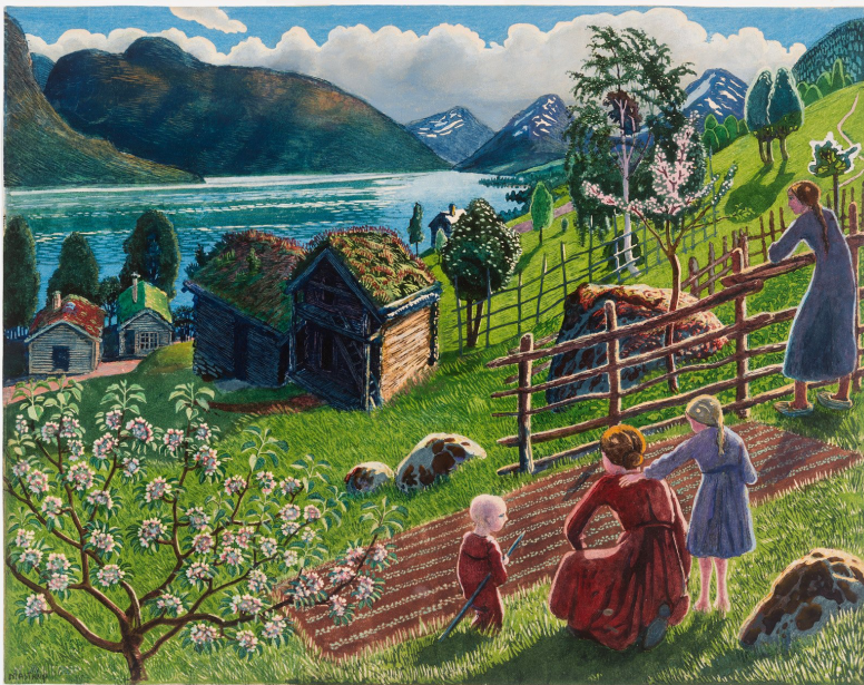
Nikolai Astrup (Norwegian, 1880–1928), Growing Season at Sandalstrand , linoleum and woodblock, 1923; print, 1923. Color linocut and woodcut with hand coloring on paper, 16 9/16 x 21 in. (42 x 53.4 cm). Savings Bank Foundation DNB / KODE Art Museums and Composer Homes, Bergen