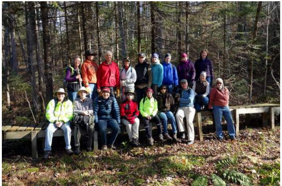
Ice Age Trail Hike—Nov 1, 2014