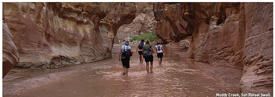
Muddy Creek, San Rafael Swell