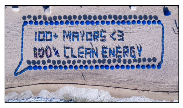
More than 120 people helped create this aerial human text message calling for mayors to join the campaign for 100% clean energy.