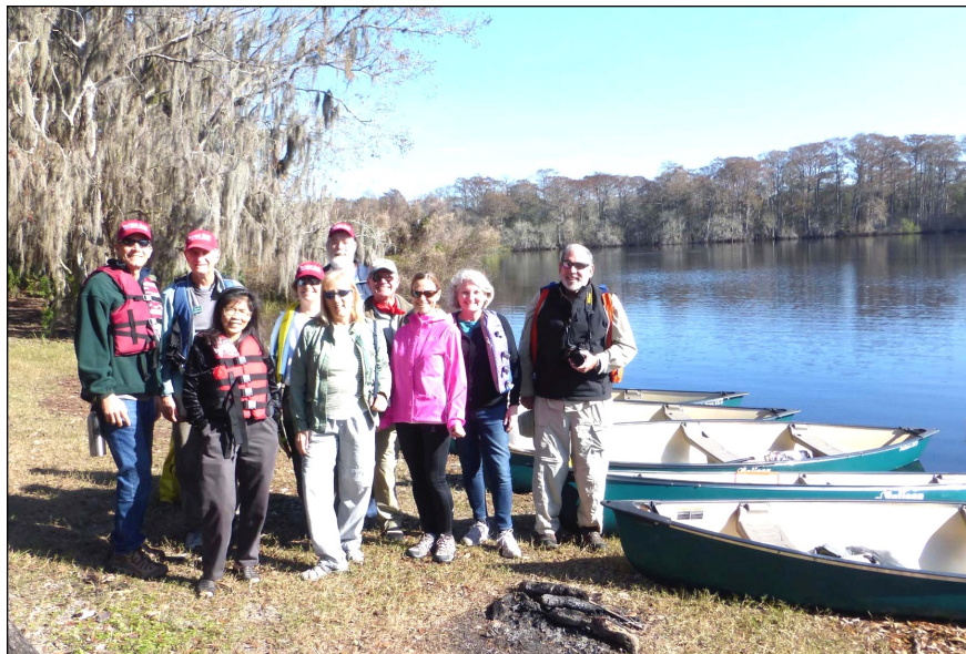
Leaders from Tampa Bay and Suncoast groups joined the Florida Wildlife Corridor Expedition on January 17 as they paddled the Withlacoochee River. The 70-day expedition is navigating a proposed corridor from the Green Swamp through the Panhandle.