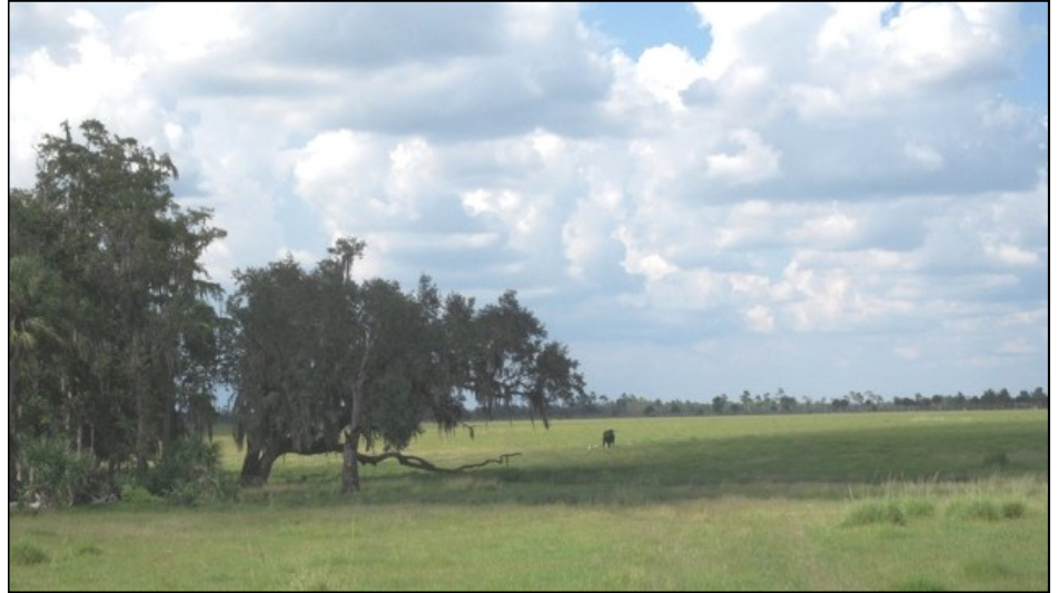
Peaceful Horse Ranch will be managed by the state for conservation and recreation.

■ Offsite mitigation projects to include a bayhead restoration demonstra-