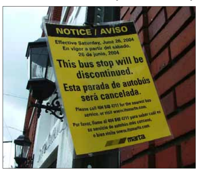
Severe Cuts Ahead? Insufficient funding has threatened transit service around the Atlanta region . MARTA may be forced to cut its existing rail and bus service by 30 percent or more in 2010.

After solemn promises were made during the interim after the 2008 Session, in 2009 the expectation was that the differences would be ironed out and that the local option funding proposal could go forward. That hope was soon dashed. The previously concealed role of the paving contractors came increasingly into the open as the "Get Georgia Moving" Coalition began to fracture during the 2009 Session. Differing versions of the bill passed each Chamber but agreement proved