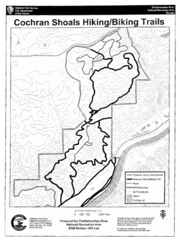
Sope Creek proposed trails

The Park service speaks of erosion prevention. Already, the ground where the trail crosses drainage ditches is beginning to be torn up by knobbed tires and there is also erosion damage in sharp curves where bikers run high into the banks. One then must assume the NPS is not serious about erosion control as the new trails would be subject to similarly damaging use. If they want to allow mountain bikes in the park then the trails must be clearly separated for hikers and bikers. As it looks now the park is projected to become a mountain bike mecca. This we should object to. The plans for the parks can be found under http://parkplanning.nps.gov. Please, plan to attend future meetings so that you have a say as to what is going to happen to your parks.