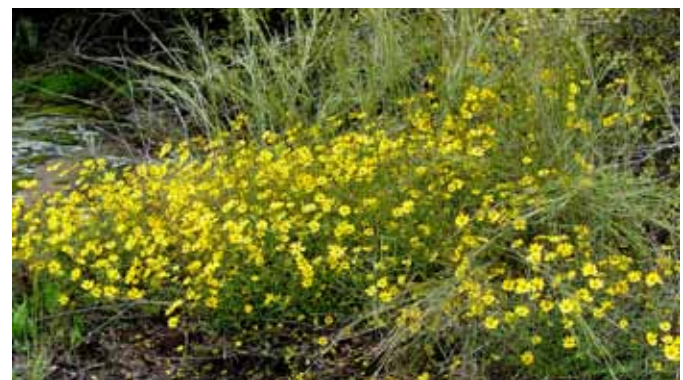
Grass Sedum (top) and Confederate Daisies (bottom)