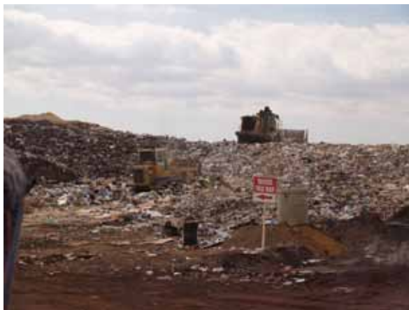
Landfills could fill faster under proposed "biomass" schemes

The Georgia Chapter continues to work at the state capital and with local communities to keep yard waste out of the landfill and incinerators from polluting our air and water.