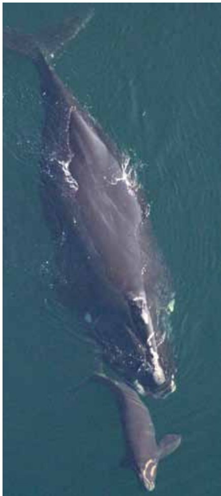
A right whale with calf off of Georgia's coast

people knew little about these magnificent animals beyond what they needed to successfully hunt them and derive products from their massive bodies. Today scientists and conservationists are working hard to catch up and learn as much as possible about the whales and hopefully save them from the brink of extinction.