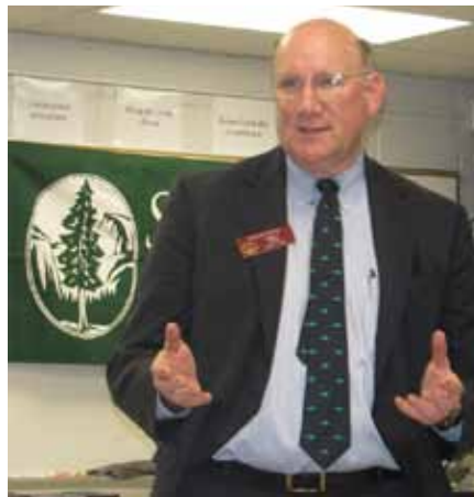
Rep. DuBose Porter addresses the group