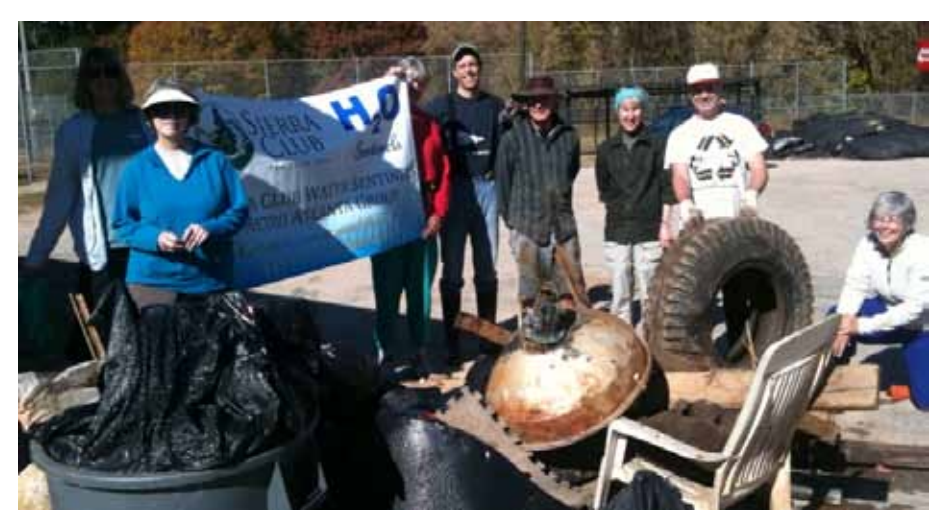
Atlanta Group members pose with their treasures from Peachtree Creek.