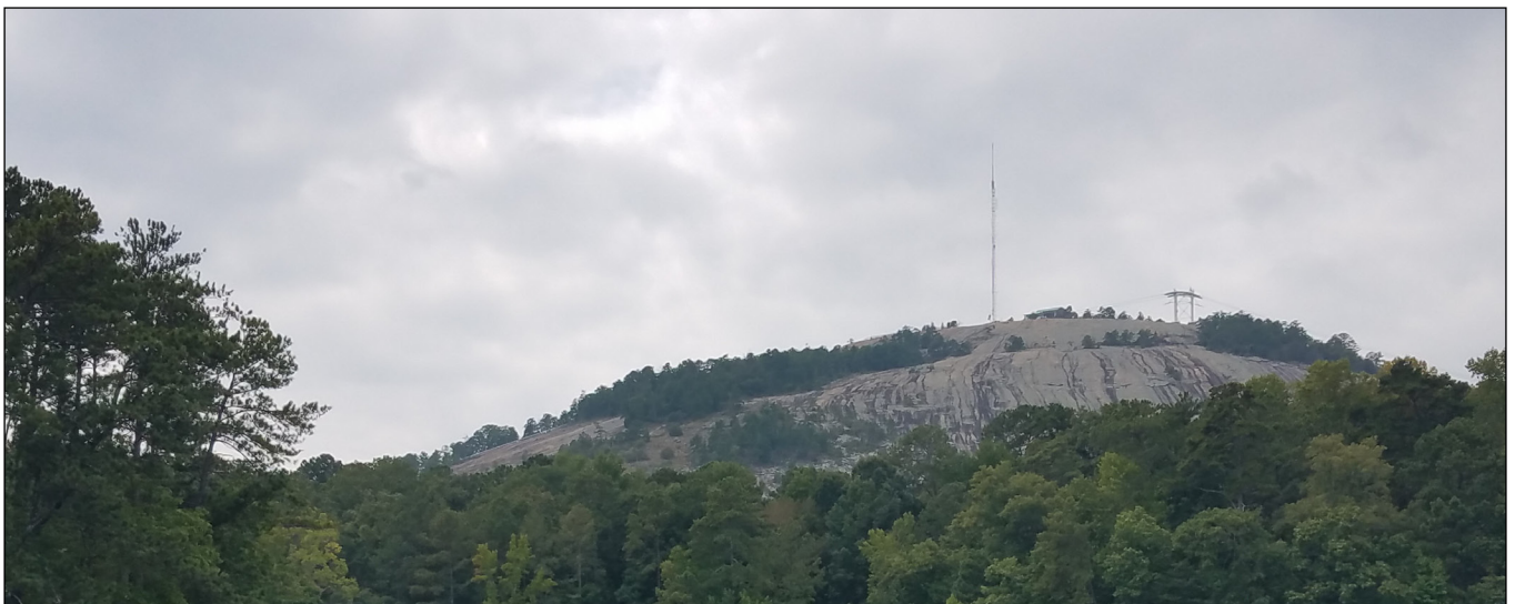
In May, the Sierra Club Georgia Chapter adopted a new issue: supporting the movement towards the transformation of Stone Mountain Park to make it a welcoming place for all.