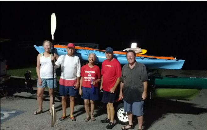
Savannah River Group members on a pre-COVID midnight paddle.

known as Little River. At the top of German Island we turn back downstream to completely circle the Island and end the trip back where we started. Either day or night, this is an immensely popular kayak route because paddling a complete circular route eliminates having to ferry, drop, and park a vehicle downstream as most of our other kayak outings require.