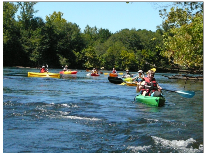
Photos from the LaGrange Group's pre-COVID outings paddling down the Chattahoochee River.

the U.S. Army Corps of Engineers at 706-645-2929 the morning of your float to verify the water release schedule.) There is a canoe livery that can provide shuttle services out of West Point that may make the activity simpler.