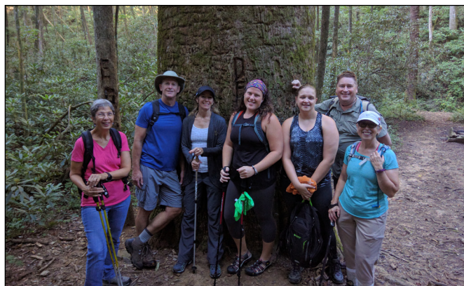
Photos from three of the Centennial Group's pre-COVID outings.

4.5-mile moderate, double loop featuring pine and hardwood forests, wooded glades filled with ferns, bridges over streams, and a look at an historic Civilian Conservation Corps quarry. It is suggested to hike the West Loop first because it is longer than the East Loop. The unmarked spur to the C.C.C. quarry is on the east side of the East Loop, and travels downhill and across a short bridge to the stunning quarry pond. Shaded rocks on the far side of the pond are a perfect spot to have a picnic, watch the fish, and listen to the