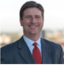
Congressional District 4 Greg Stanton (i)

Representative Gallego is a strong advocate for environmental protection and holds an important seat on the House Natural Resources Committee, where he has worked hard for the protection of public lands and wildlife. He is also an advocate for action on climate change and promoting clean energy resources and supported strong climate provisions in the budget reconciliation bill. Sierra Club enthusiastically endorses Representative Ruben Gallego.