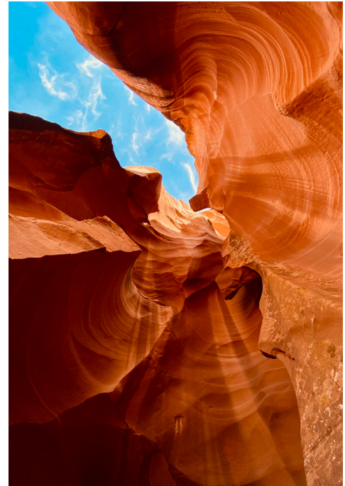
Antelope Canyon.