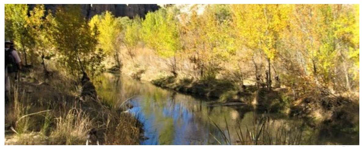
Autumn on the Upper Verde River