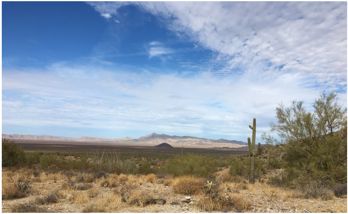
View from the Harcuvars