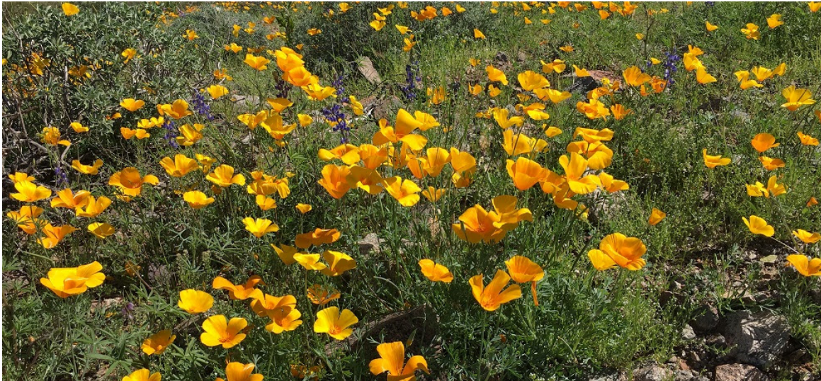
Poppies on public lands west of Phoenix

This week it will be all Floor action, Rules Committee, and caucusing about bills. You can watch the Floor action in the House and Senate by using this link .