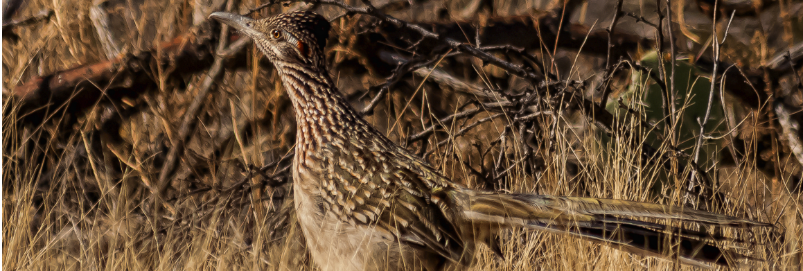
Roadrunner