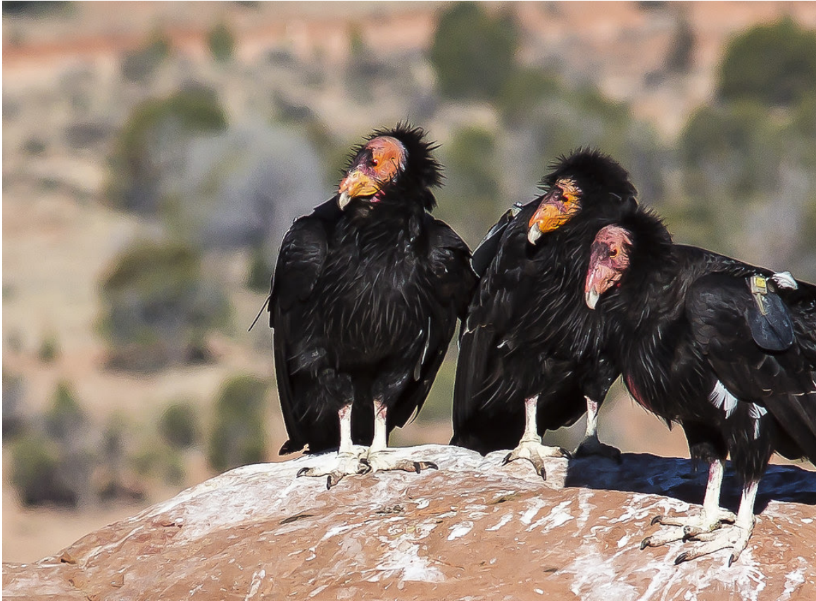
California Condors at Vermilion Cliffs National Monument