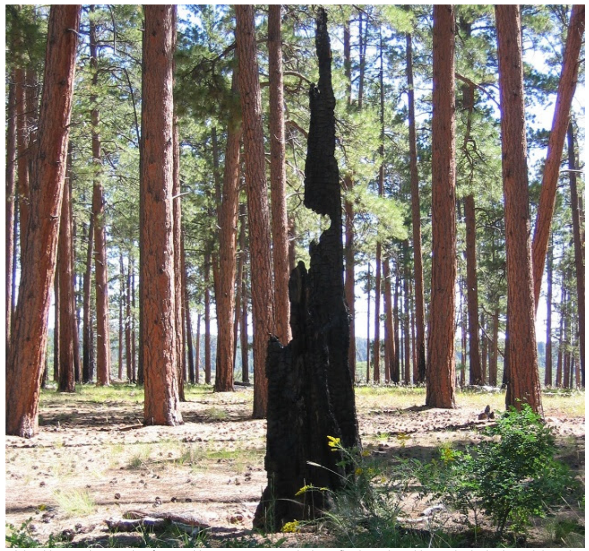
A healthy ponderosa pine forest with mature trees and where fire has played its ecological role and there is no livestock grazing. Fire Point, Grand Canyon National Park.