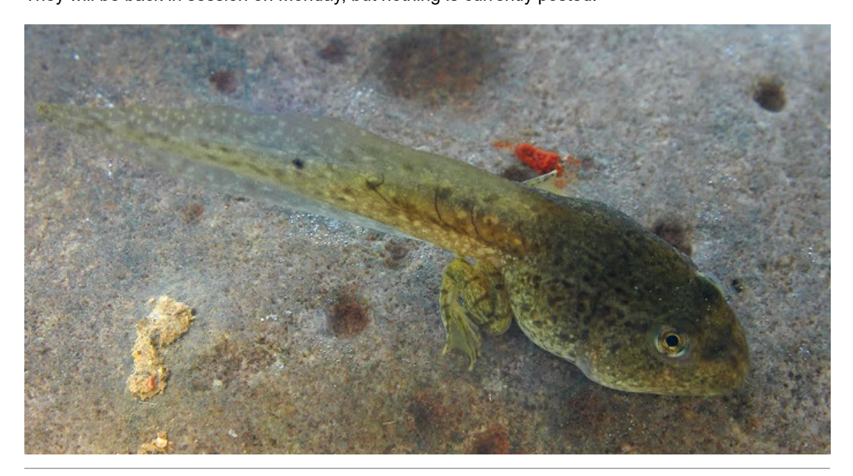
Chiricahua leopard frog tadpole

They will be back in session on Monday, but nothing is currently posted.