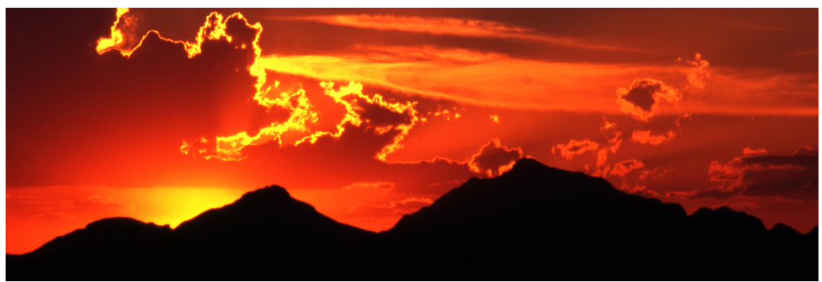
Sunset at Saguaro National Park