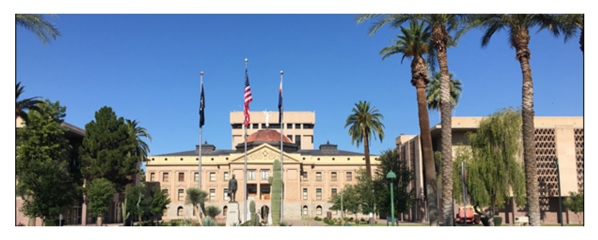
April 22, 2022