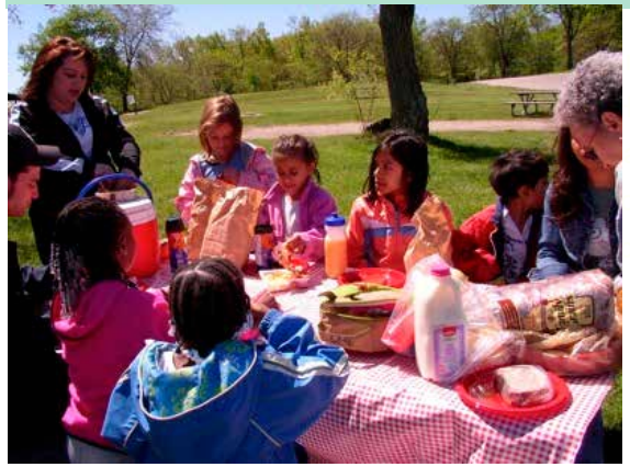
WICO Matthaei Botanical Gardens picnic