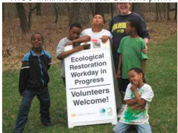
4/19/08 Matthaei Botanical Gardens