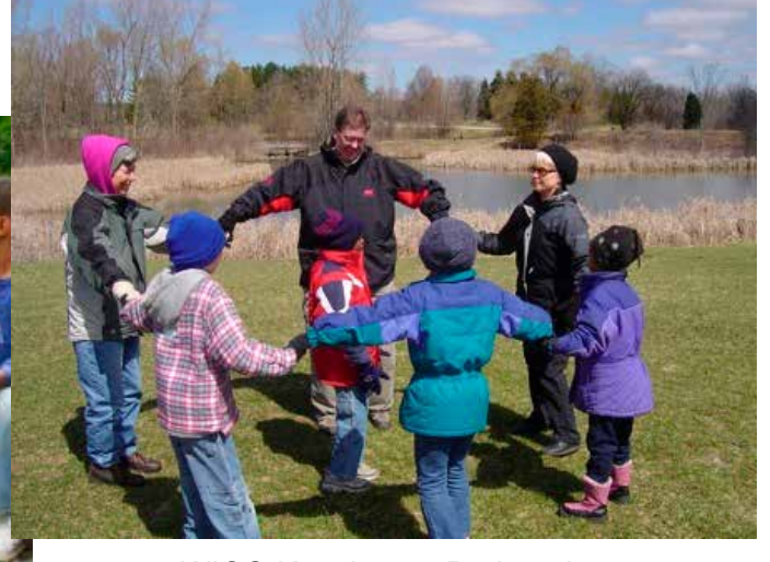
WICO Kensington Park outing