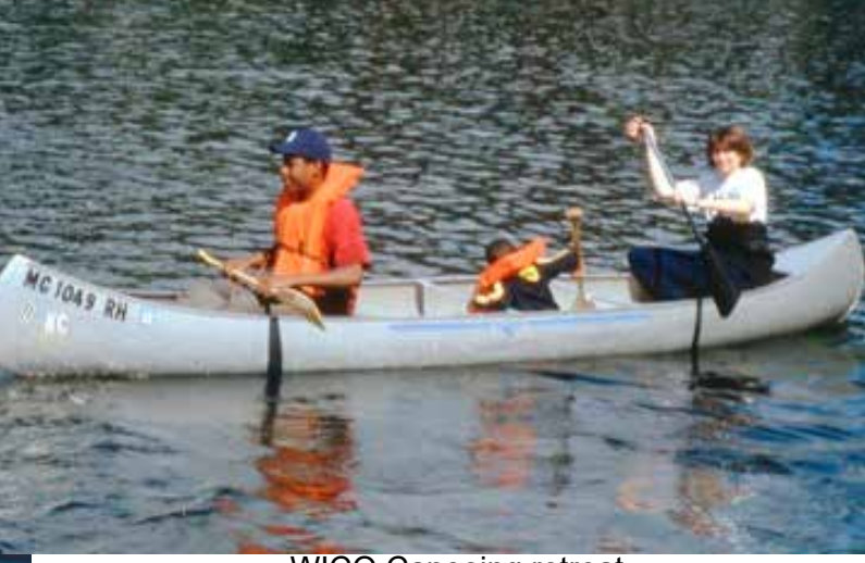
WICO Canoeing retreat Fall ballot proposals fight sprawl in AA and AA Township, taking first steps to preserve regional green space.