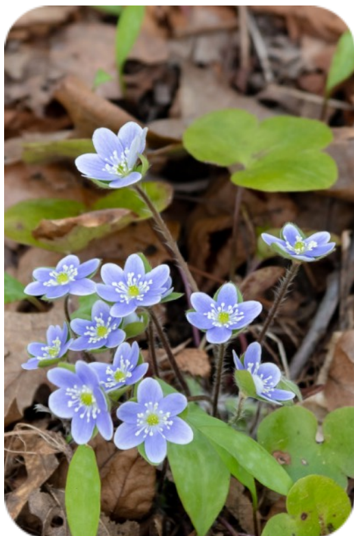
Hepatica nobilis , Barton-Kuebler Nature Area