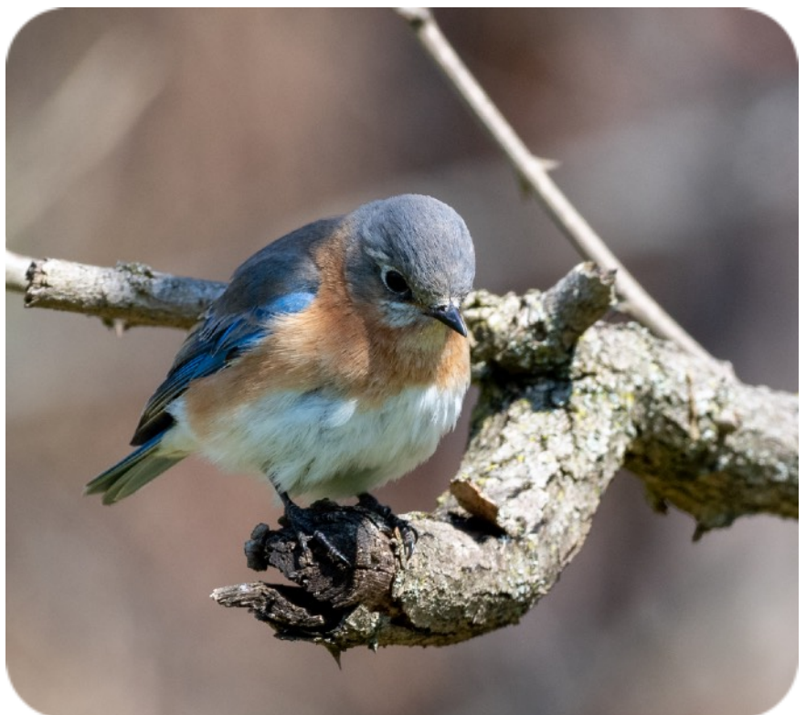
Bluebird, Park Lyndon & Pinckney State Recreation Area