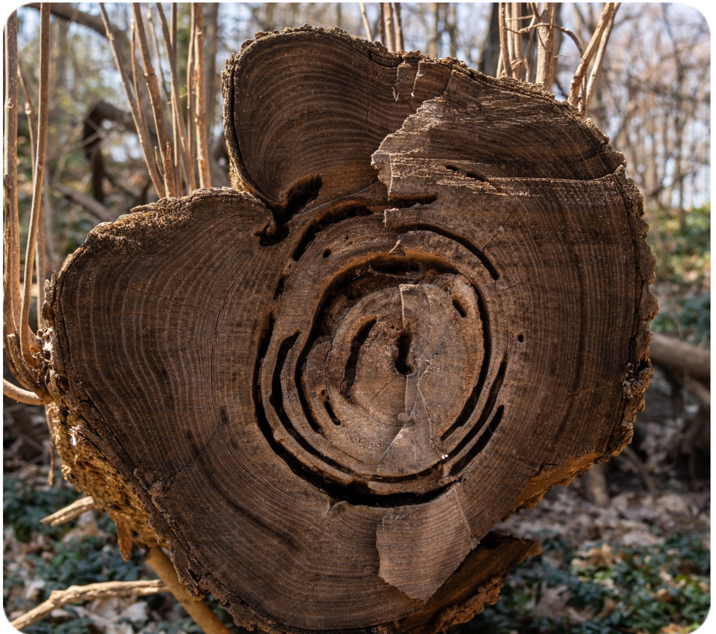
Fallen tree, Nichols Arboretum