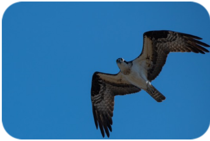
Osprey, Matthaei Botanical Gardens