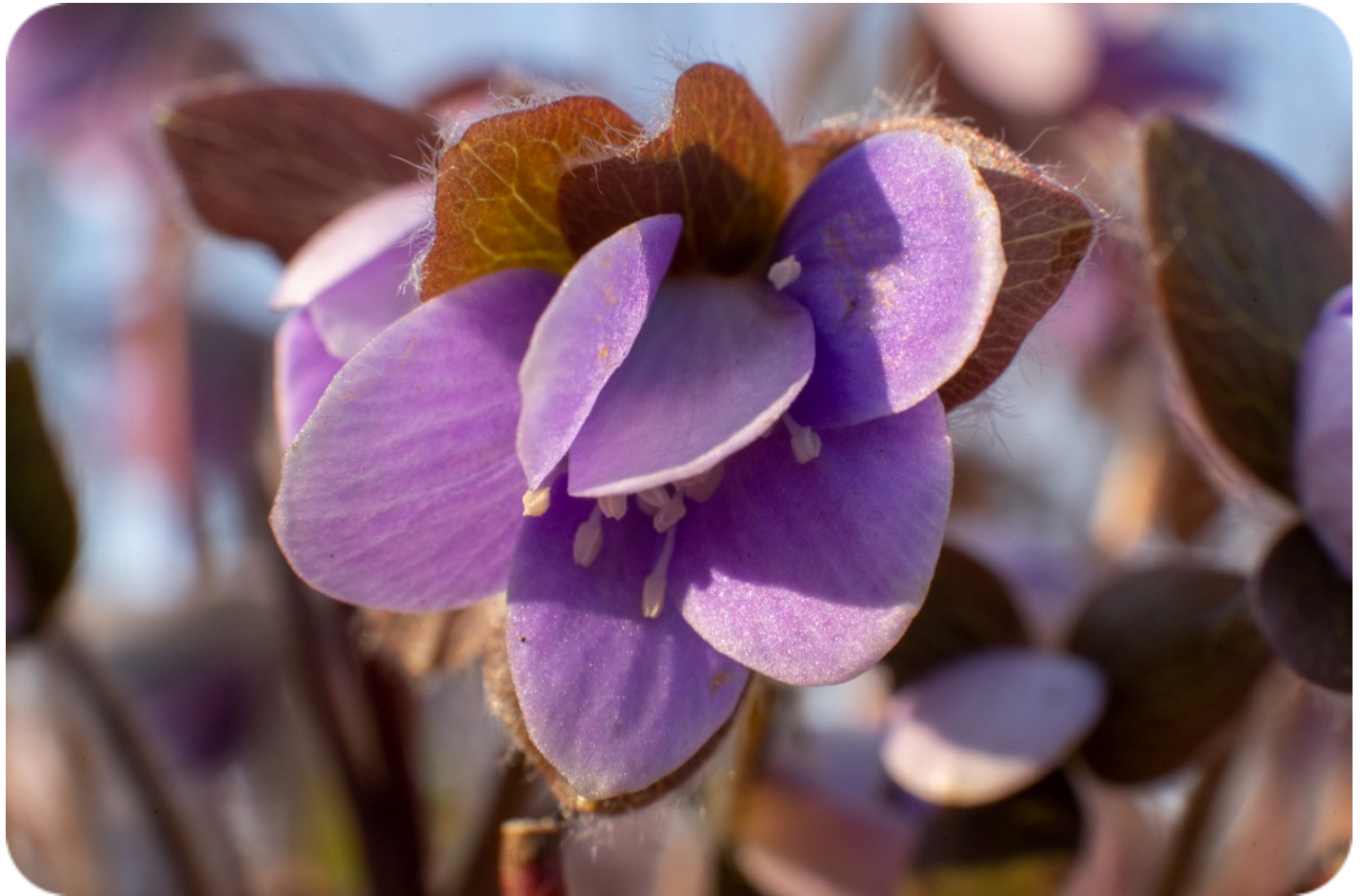
Hepatica acutiloba , West Lake Preserve