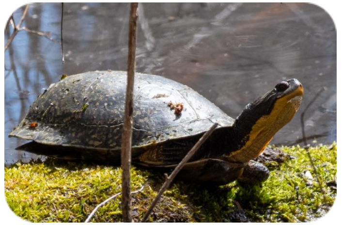
Blanding turtle, Waterloo State Recreation Area