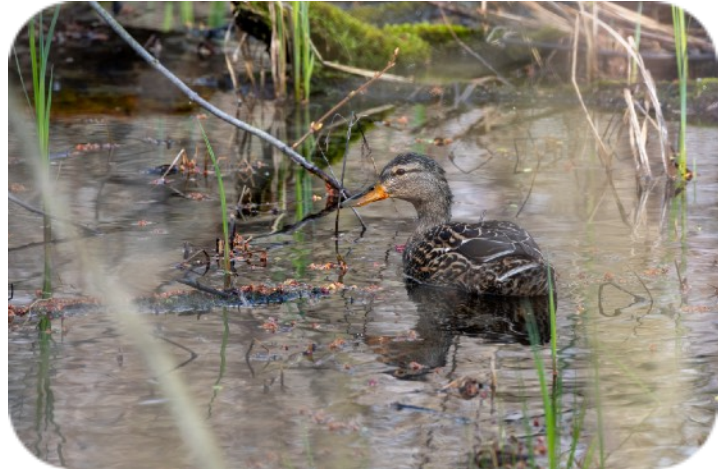
Mallard hen, Whitmore Lake Preserve