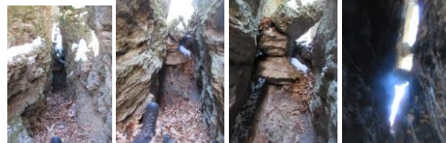
From where the slide begins. Rocks above the crevice.