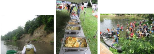
Central Iowa bluffs. Meal set-up for the throng of AWARE'ers.