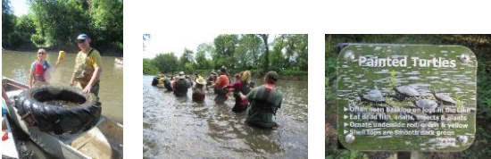
Grandad (& of tires.) Team work Tug. River & evening programs.