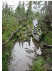
Thompson's "antique" canoe. Portage to the Kekekabic Trail, 2018.