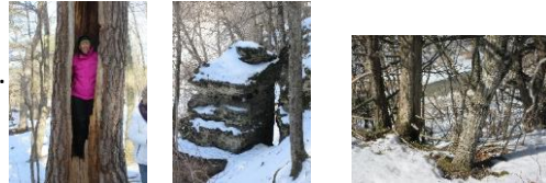
Hollow tree. Devil's Oven. Maquoketa River below.