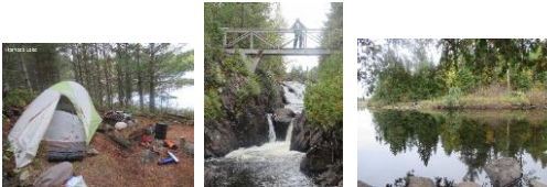
Harness Lake camp. Agamok bridge. Kekekabic Lake.