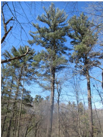
White Pine Hollow, Luxemburg, Iowa