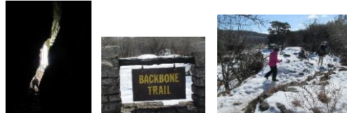
End is in sight. To the namesake. Backbone ridge.