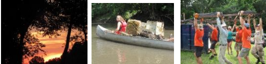
Scenes from the Boone River AWARE: 2019 Trailer frame.