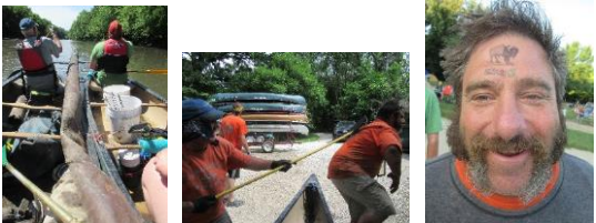
Canoes tied together. Back scratcher. It felt SOOO good!