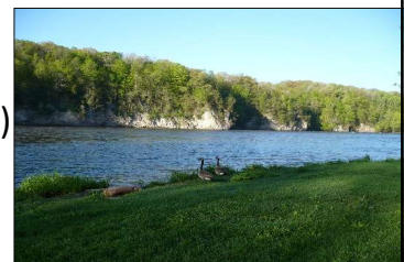
Photo: Palisades-Kepler State Park