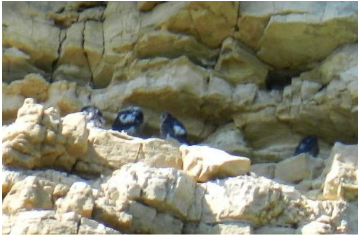
Four falcon young or eyases at Aggie's Bluff, Allamakee Co. 2012