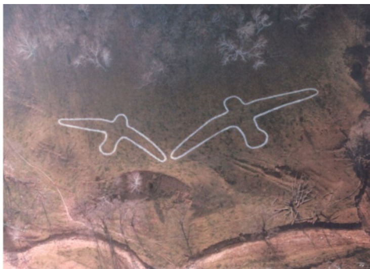
Male or tiercel effigy on left (141 ft.) is 1/3 smaller than female on right (227 ft.) just as in real life