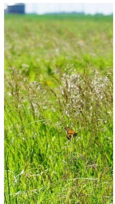
Grasses wave in the wind at Kalsow Prairie in Pocahontas County.