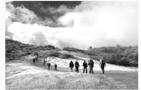
A provisional O-1 hike at Satwiwa