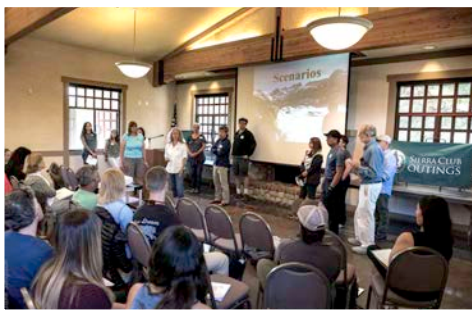
The Seminar in action

LTC offers training for aspiring outings leader candidates and others wishing to improve their skills and acquire the best leadership practices from our experienced and certified leaders. These skills will help you in the outdoors as well as in your community.