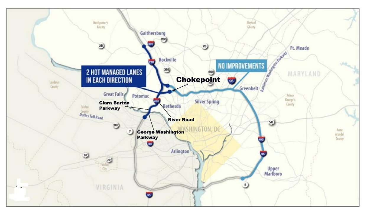
Maryland Department of Transportation State Highway Administration I-495 & I-270 P3 Office map.

Interchanges and chokepoint labeled by author.