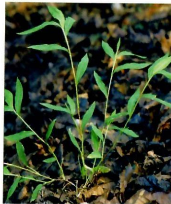
Japanese Stiltgrass Microstegium vimineum