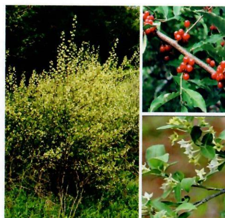
Autumn Olive Elaeagnus umbellata