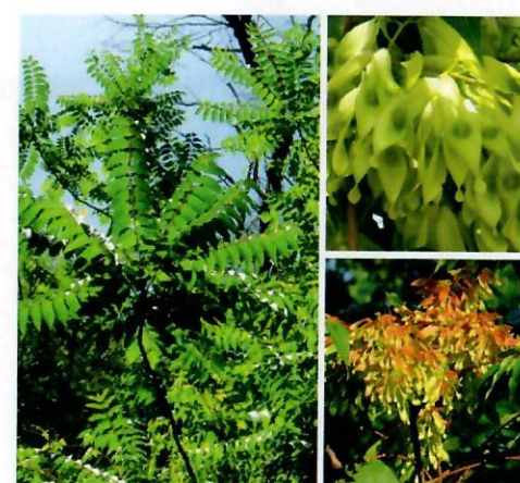
Tree of Heaven Ailanthus altissima