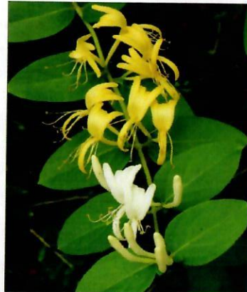
Japanese Honeysuckle Lonicera japonica