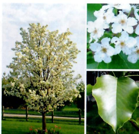
Bradford Pear Pyrus calleryana