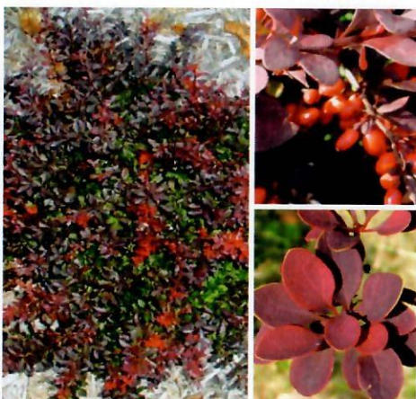
Japanese Barberry Berberis thunbergii