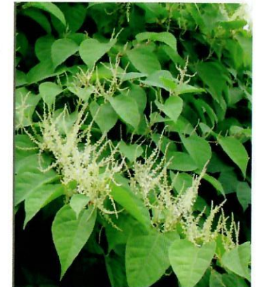
Japanese Knotweed Polygonum cuspidatum