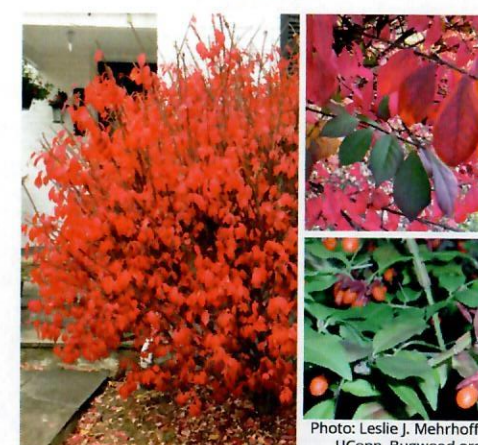
Burning Bush Euonymus alatus