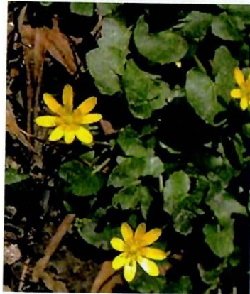
Lesser Celandine Ranunculus ficaria