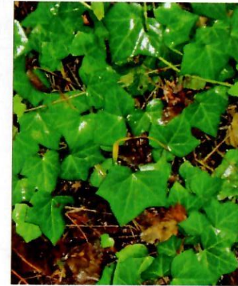
English Ivy Hedera helix