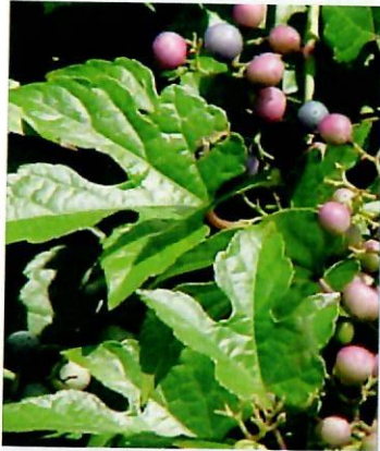
Porcelainberry Ampelopsis brevipedunculata