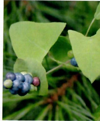
Mile-a-Minute Persicaria perfoliata (formerly known as Polygonum perfoliatum )