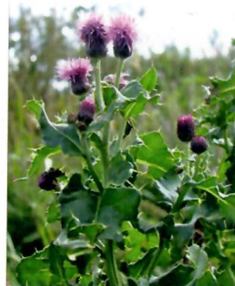
Canada Thistle Cirsium arvense