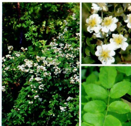
Multiflora Rose Rosa multiflora