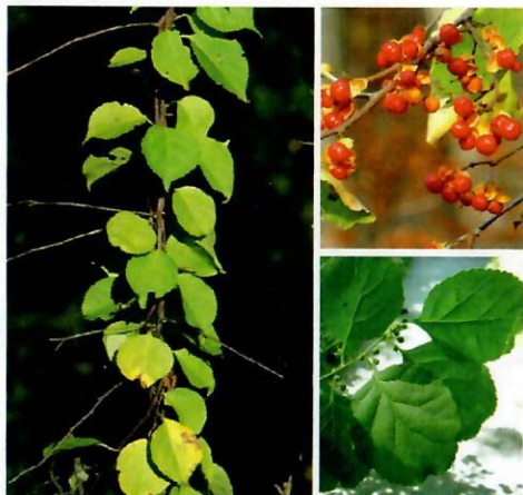
Oriental Bittersweet Celastrus orbiculatus