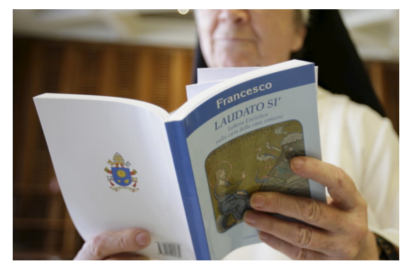
Image: Vatican Asks Catholics To Stop Investing In Fossil Fuels, And ...www.indiatimes.com