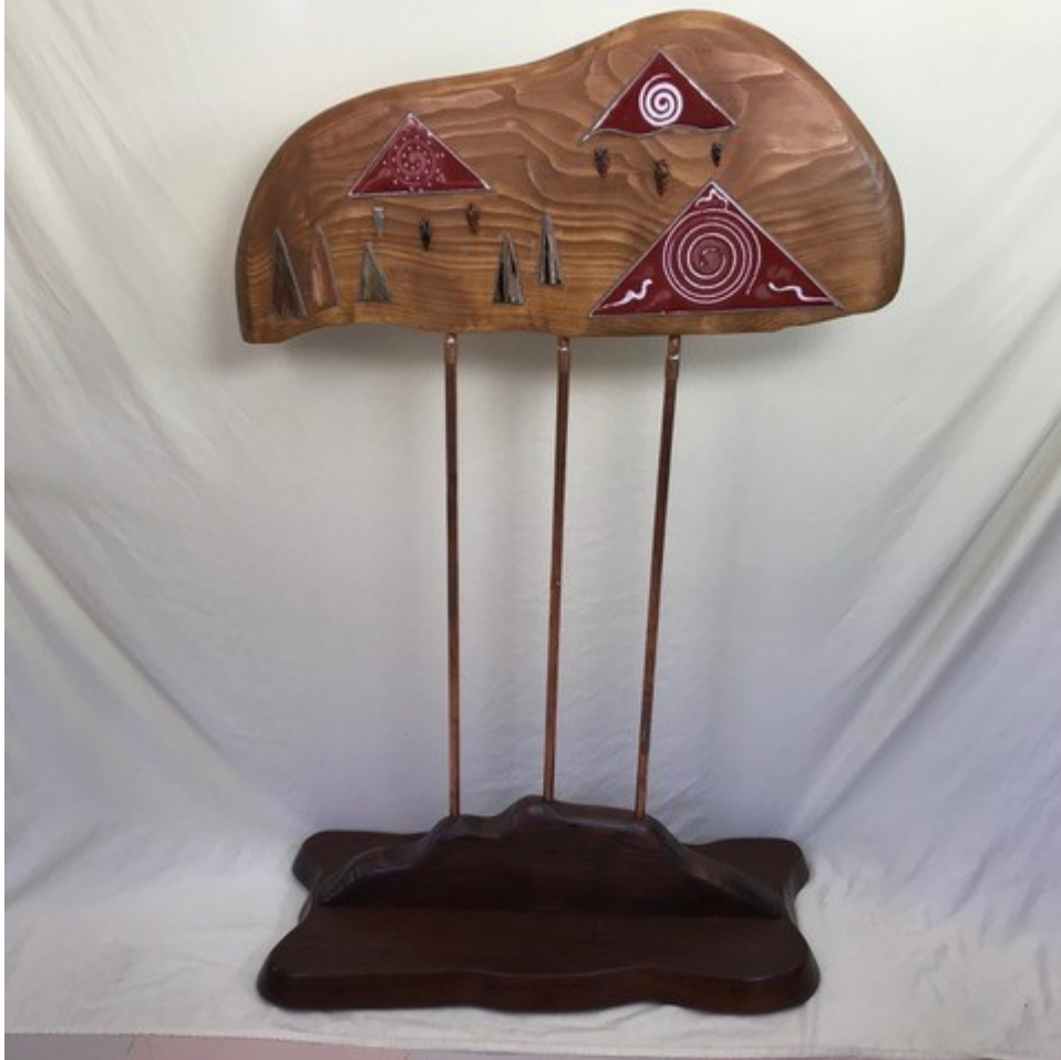
f. side one

previous donation by the Confederated Tribes of the Grand Ronde of the Lamprey Bench. She said that the decision to accept artwork for display in the Library must now be approved by the Library Board and she will be happy to present it to them.